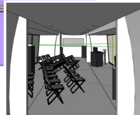
Int View 3